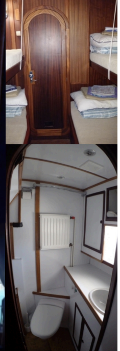
s/y OCEAN - A