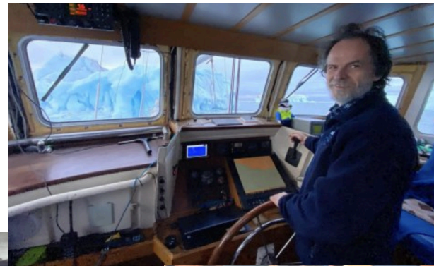
s/y OCEAN - B